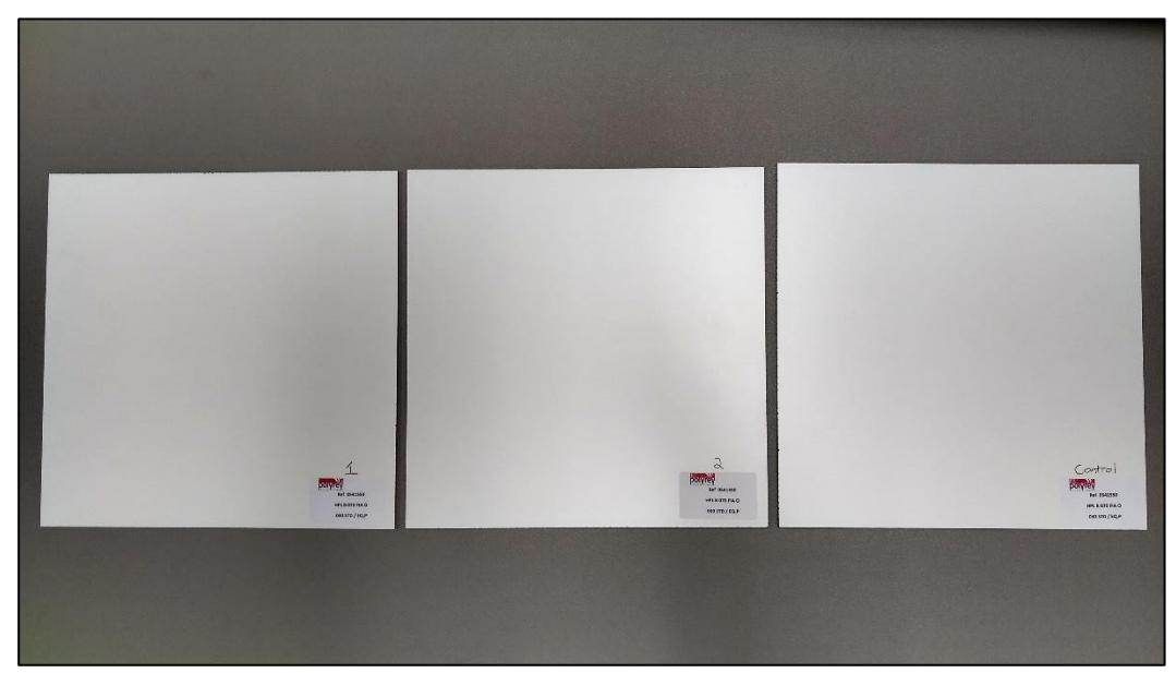
Figure 4 Sample fronts after testing