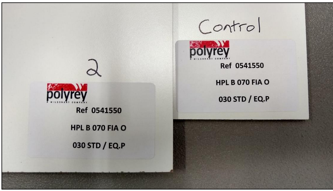
Figure 5 Close up of sample 2 and control after testing