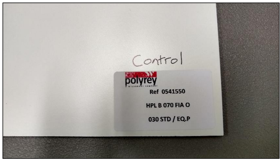
Figure 3 Close up of control sample