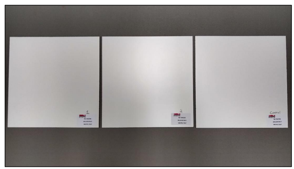
Figure 2 Sample fronts before testing